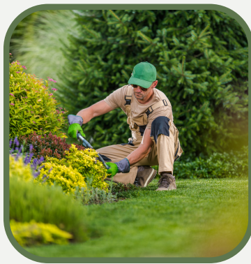
Prune bush and climbing roses