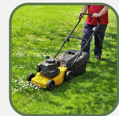
Mow the lawn on dry days (if needed)