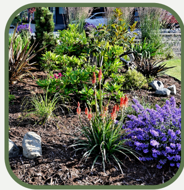
Lift and divide overgrown clumps of perennials