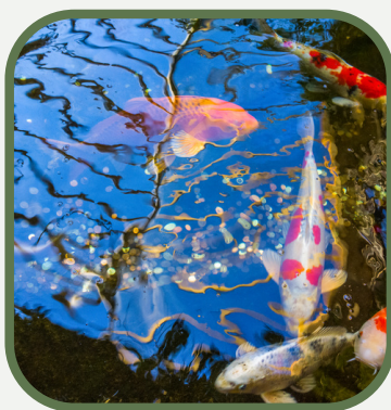
Start feeding fish and using the pond fountain; remove pond heaters