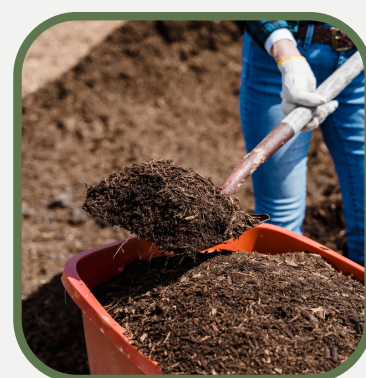
Top dress containers with fresh compost