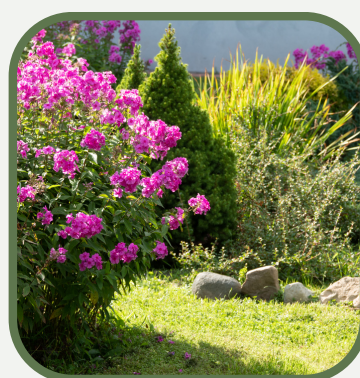
Lift and divide overgrown clumps of perennials