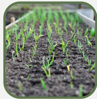
Plant shallots, onion sets and early potatoes