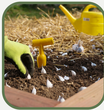
Plant summer-flowering bulbs